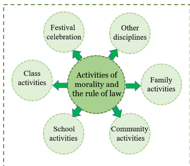
Figure 2. The activities of morality and rule of law lessons can be combined with other activities.

educational activities is essential for improving the effectiveness of the curriculum. The activities of morality and rule of law lessons should be combined with other activities that students involved in, as shown in Figure 2.